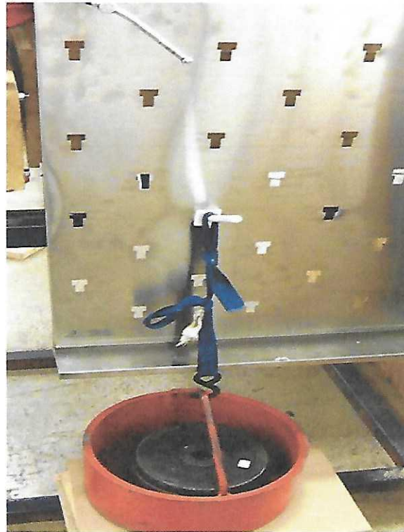
Peg Static Load